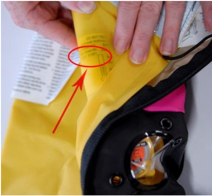
Photograph showing view of lot number through fabric.